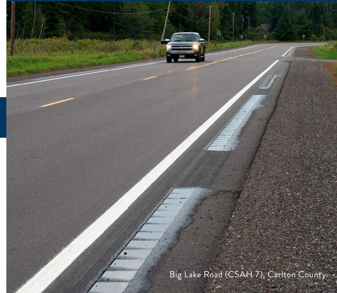
Big Lake Road (CSAH 7), Carlton County

Reported bridges are on state trunk highways, county roads, city streets, and township roads, and do not reflect number of bridges owned by each agency type.