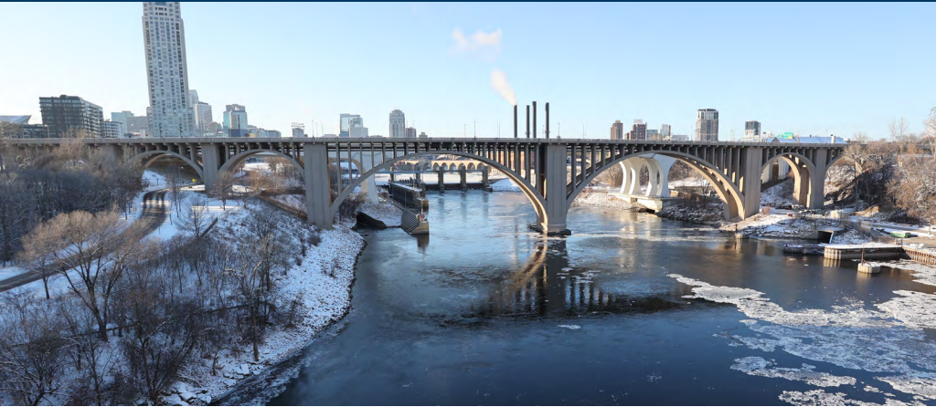
Tenth Avenue Bridge (Bridge 2796), City of Minneapolis

Minnesota's economic strength and vitality depends on an effective transportation system. To support the state's system of streets, roads and bridges, the Minnesota Department of Transportation distributes funds for highway maintenance and construction to counties, cities and townships based on a formula determined by the legislature.